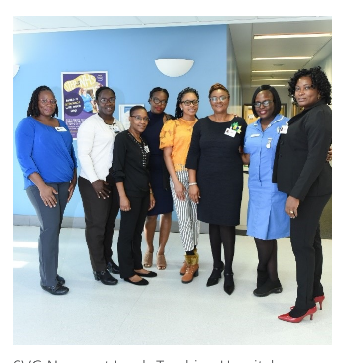
SVG Nurses at Leeds Teaching Hospitals

Hon. Ralph Gonzales, Prime Minister of St Vincent and the Grenadines